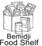
Bemidji Food Shelf

Trinity, along with United Methodist Church volunteer the 1st Monday of each month at the Food Shelf. The first shift is from 9am-12pm and the second shift is from 12-3:30pm. Both shifts need 6-7 volunteers.