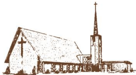
Trinity Lutheran Church 123 29th Street NE, Bemidji

Our Church Directory is powered by Instant Church Directory .