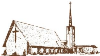
Trinity Lutheran Church